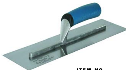
ITEM NO. 13-412G